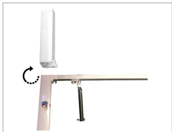
Motor Upward Kit